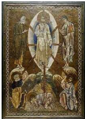
Transfiguration of the Lord August 6th