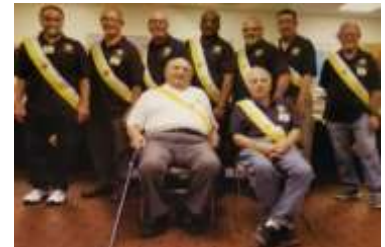
1 st Degree Team